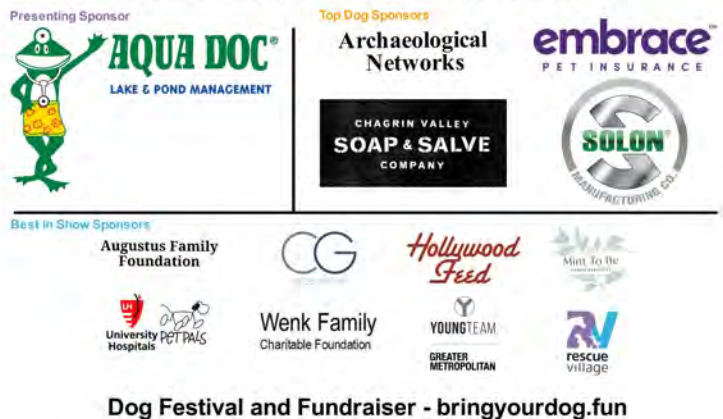
Billboard on I-271