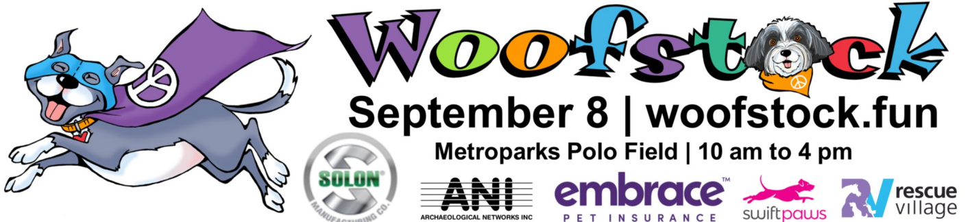
Billboard on I-271

Sunday 9.8.24 - 10 am to 4 pm Metroparks Polo Field | 12 & Under FREE