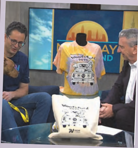
A New Day Cle