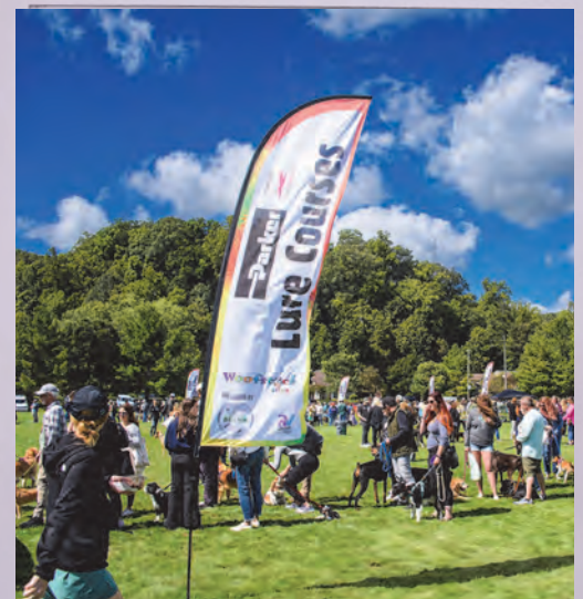
Event Flags Onsite